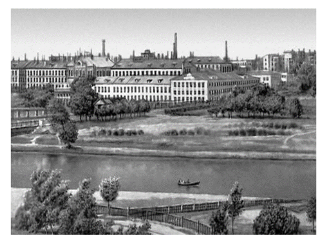
Textile enterprise: "Big Ivanovo Manufactory" (BIM)

sis but textile enterprises have historically been city-forming. The creation of the cluster was an innovative project to modernize the domestic textile industry.