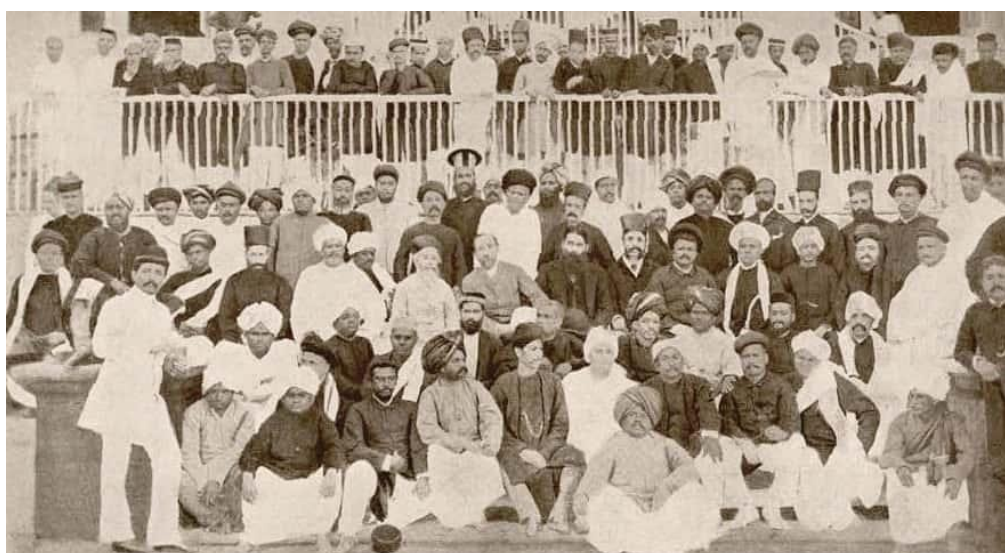
Delegates of Indian National Congress, 1885

The Indian National Congress Party was the first party in India to unite representatives from all over India. The party was created on December 28, 1885 in the city of Bombay. It was created by the British to control society. It is this party that will lead India to independence on August 15, 1947. The period from 1885 to 1914 is the initial period of development of the party. It is very important to see how the struggle for the future took place.