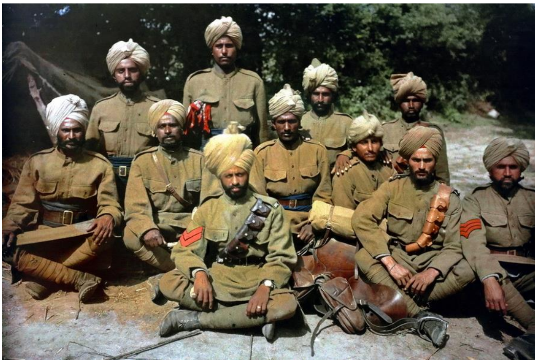
British Indian soldiers in France, 1917

But the author admitted that the British not only do not prepare the ground for improving life, but also worsen this life. Historian John Robert Seeley concludes that most likely the best option for India will be a government consisting of representatives of the Hindu population. The author believed that such a government could benefit people. In our opinion, the author recognized the impossibility and unwillingness of foreign governments to provide a high standard of living for people.